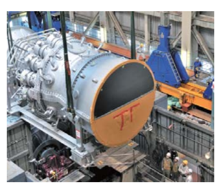
Chita Daini Thermal Power Station, Unit No. 2 gas turbine

Reduce capital investment, fuel costs and miscellaneous costs by revising construction methods, practicing economical fuel procurement and use, revising publicity and sales initiatives and R&D/system development