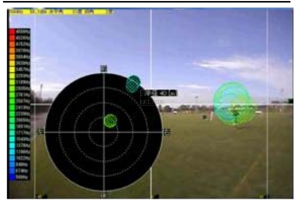
Earlier sound camera measurement results