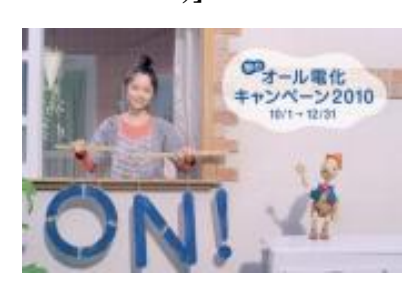
[Television commercial (IH version)]