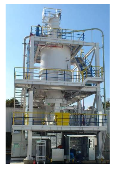
<Facility for receiving carbonized sewage sludge fuel>