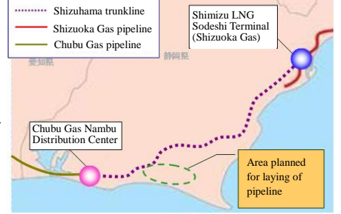
Laying of Minami Enshu pipeline

• Proposal of energy solutions services exploiting the respective strengths of electricity and gas, for example provision of optimal combinations of energy sources, optimal operating methods, etc., in response to demand for diversification and realization of increased sophistication